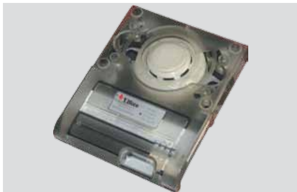
Duct housing with an LE-ALG-DH analog photoelectric sensor.